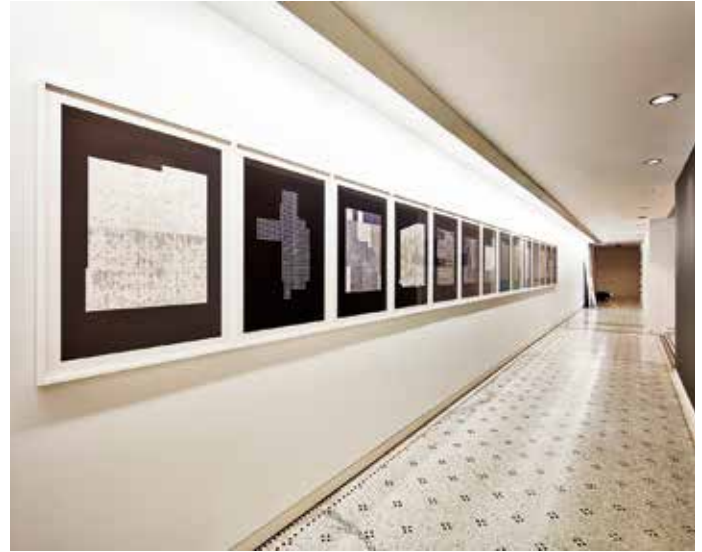
Figure 6. Chicago Series , by Philipp Schaerer, Zurich.

In the opening essay of the catalog, or publication companion of the CAB (which offers additional critical perspectives on a variety of topics, thus augmenting with written essays the cultural contributions offered by the exhibition), Philip Ursprung sheds an interesting light on the relationship between art and architecture in our time. Under the title of “Melancholia - Write New Theory,” Ursprung’s essay describes the experience of a field trip that the author took with students and colleagues from the ETH (Polytechnic of Zurich) across the “heart” of Europe, in the Spring of 2017: from Zurich through Colmar, Strasbourg, the Ardennes, Lille, Dunkirk, the Rhine Delta, up to Rotterdam. While the “melancholic” metaphor helps Ursprung to build an argument for the value of history and theory within the architectural discourse, the journey through places that stirs memories of Europe’s past conflicts and current crises (such as Brexit and the wastelands left by the transformations and the evolution of industrial economies), as well as the engagement with current European artists (especially in the field of photography), seems to culminate for the author with an interesting realization: