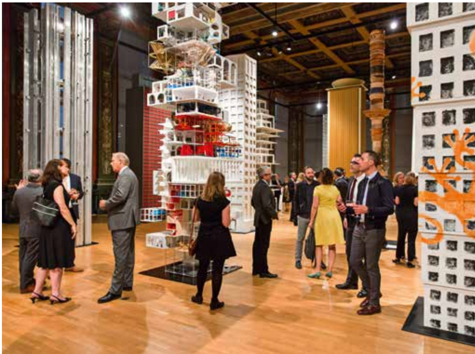
Figure 9. CAB opening night, September 14, 2017.

I do agree with Shaw, though, that the danger of this CAB is to see, once again, “the complexity of history reduced to precedent” - but this is not a particular flaw of this CAB, as it is a flaw of our general architectural culture, primarily nurtured in architecture schools, offspring of the “legalistic” character of our society (a precedent is the basis to support a legal argument in court). As I discussed elsewhere, 18 history is not a “quality certificate” for a design nor a catalog to borrow from or where to digitally “copy & paste & photoshop.” It is a cultural bedrock that we need, for mature, substantial, narrative-wise “thick,” new designs, ideas, visions (not “new histories”: if anything, “new stories”). History cannot be superficially intended as a “treasure trove.” History is the necessary “ladder” than one has to climb, in order to reach a higher level of discourse and narrative, but one that needs to be abandoned, because not directly useful when immersing oneself in the (modern) design process. Thus Mimi Zeiger’s critique to this CAB is on the mark when she observes that “if architecture as intellectual inquiry (biennials, academy, books) and profession (high rises, houses, mini-malls) is to continue to carry meaning, it needs to take