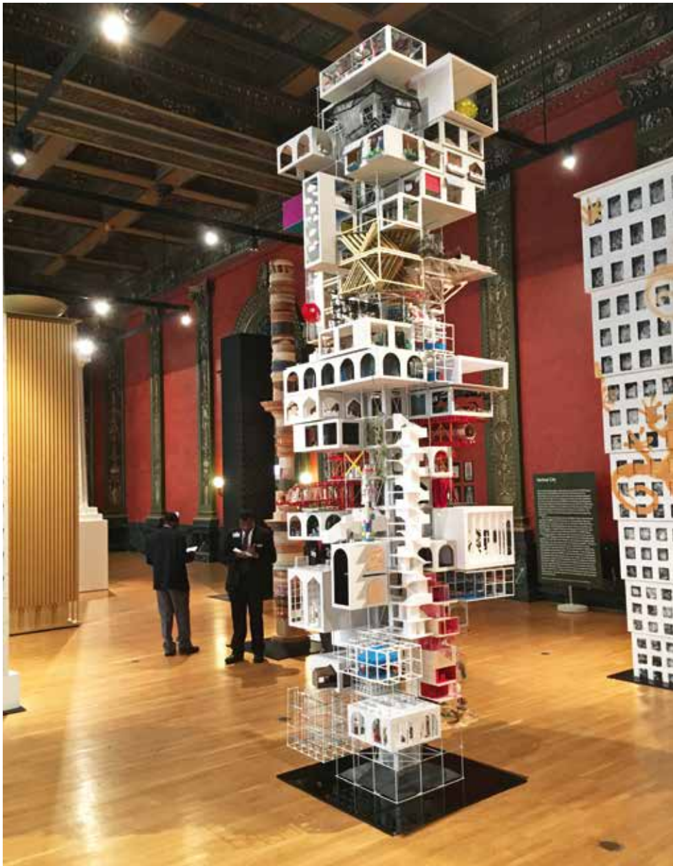
Figure 1. (Not) Another Tower , by Tatiana Bilbao Estudio, Mexico City (Mex.), for the CAB’s section “Vertical City.” The section features the works of sixteen architects from around the world invited by the curators to re-imagine the brief of the 1922 Chicago Tribune Tower design competition.