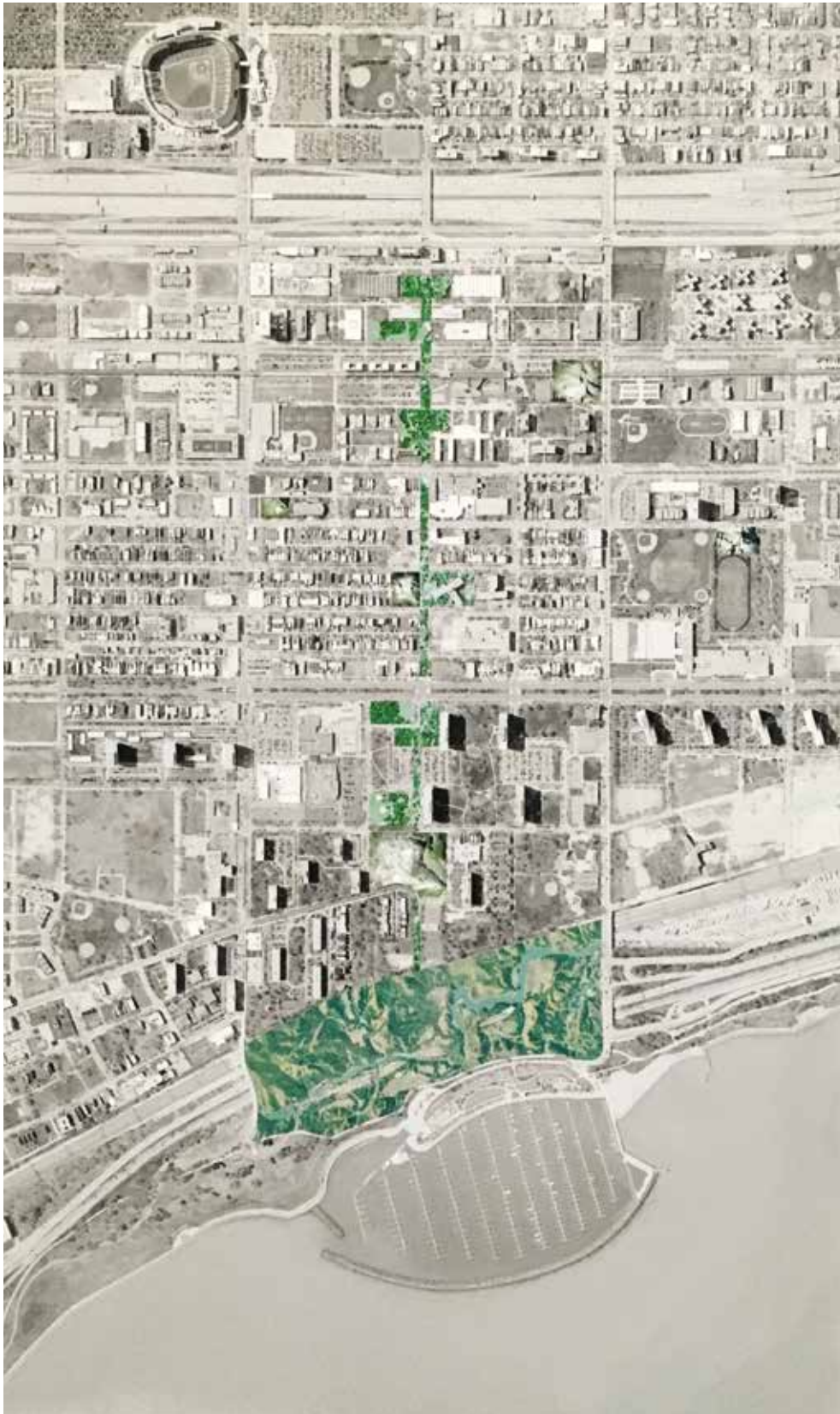
Figure 7. Lake 33rd, Bronzeville , by IIT College of Architecture + SANAA, Chicago + Tokyo. "A proposal of strategic intervention as a series of connectivities between the IIT Mies Campus, Bronzeville, and the lakefront." (From: exhibition legend.)