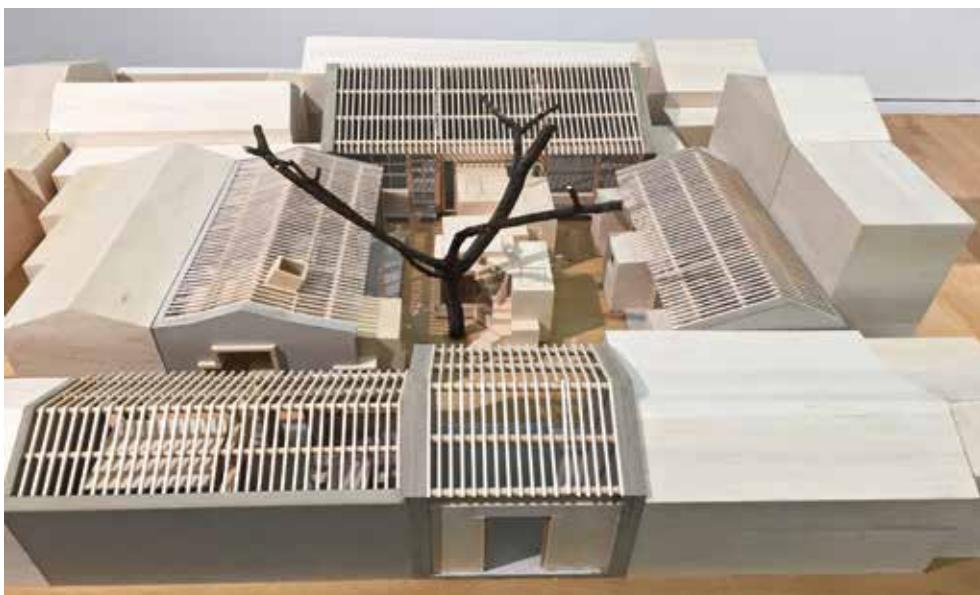
Figure 3. Make New Hutong Metabolism , Beijing, by ZAO/standardarchitecture, Beijing.