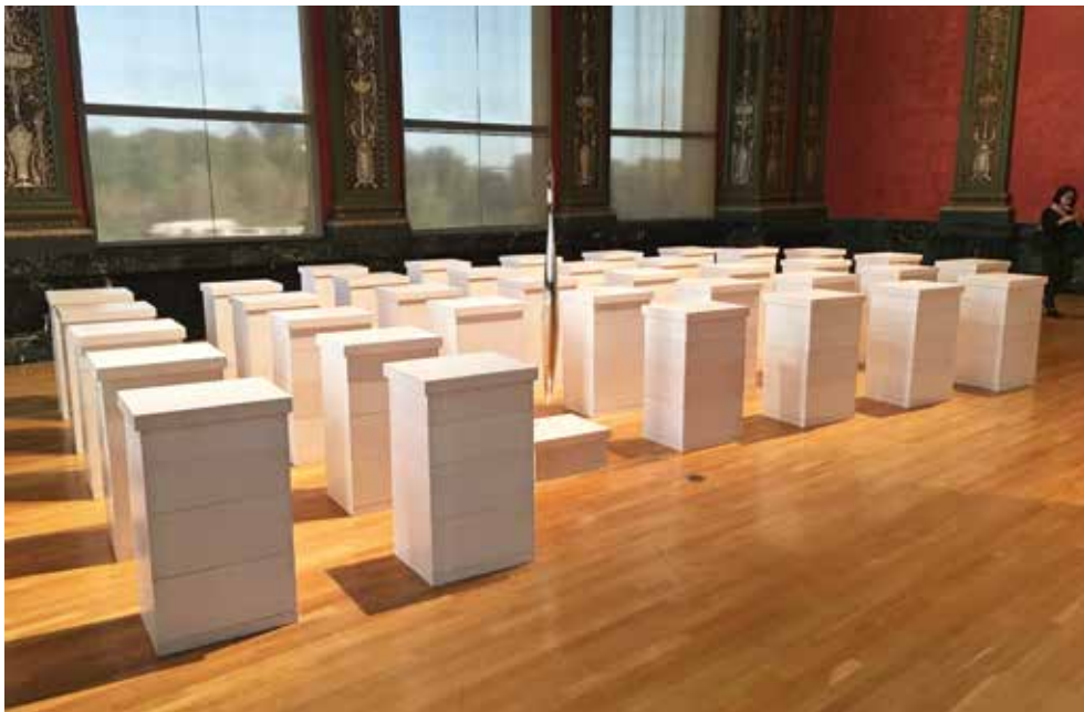
Figure 2. Beehives with Asteroid , 2013-17, by Iñigo Manglano-Ovalle, Chicago.

contrary to Johnston's claim that "what is powerful about the Biennial taking place at the Cultural Center, is that it is already a community building," 4 I agree with Aaron Betsky, for whom "no matter how grand it is, [... the Chicago Cultural Center is...] a particularly bad place for any exhibition, because of its disjointed layout." 5 Lambri's photographs are only the most striking art pieces in a very interesting section dedicated to photography, A Love of the World , curated