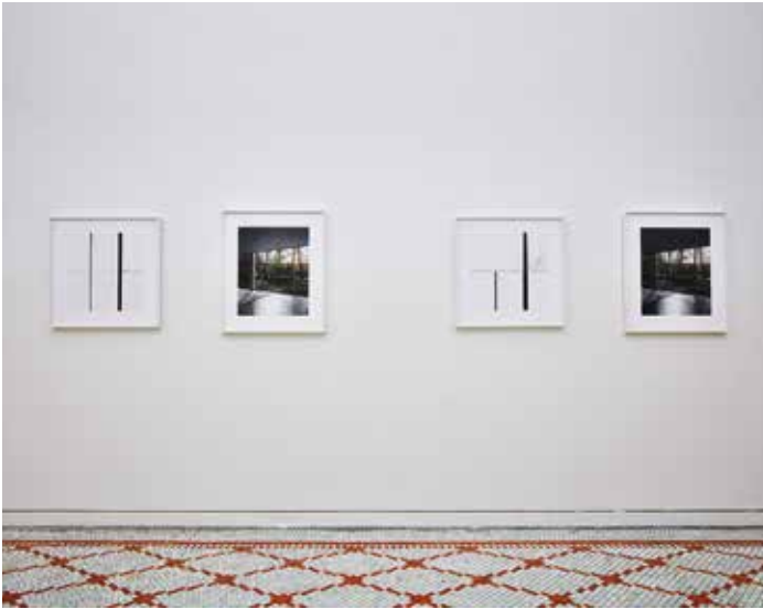
Figure 5. Farnsworth House , by Luisa Lambri. Milan.