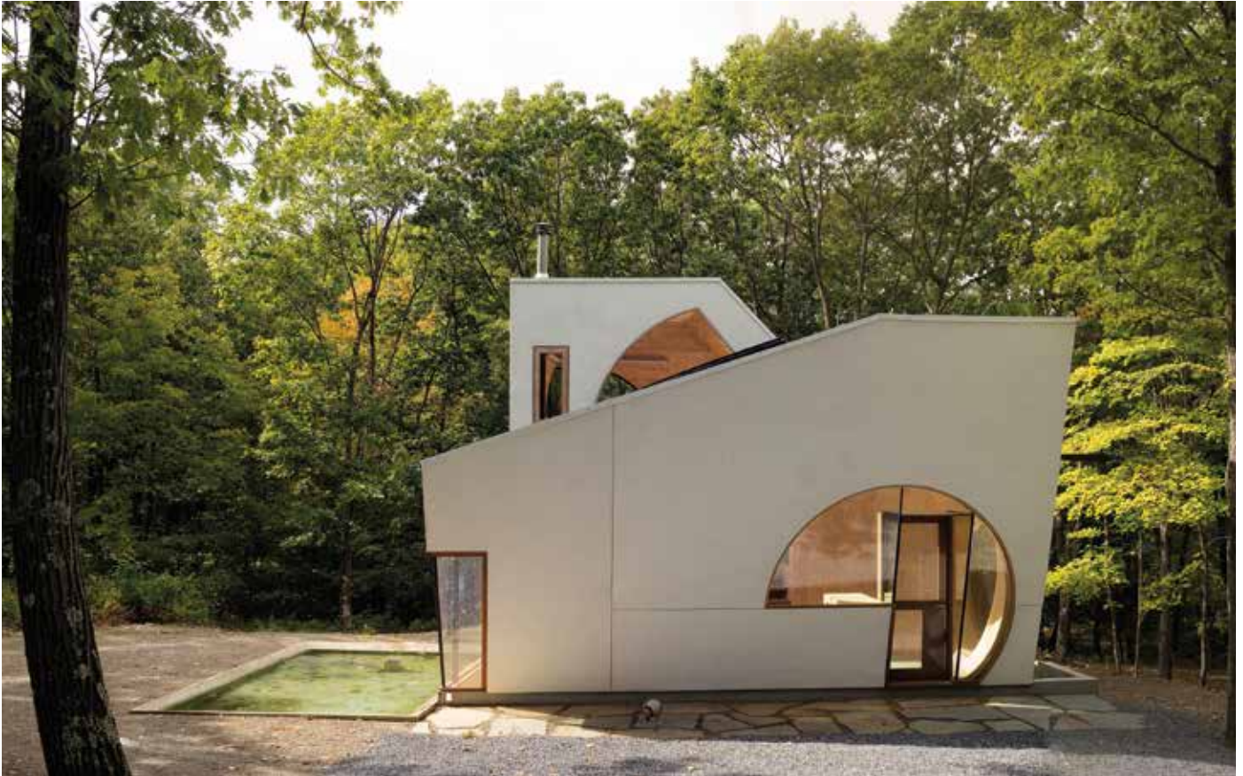
Figure 1. The Ex of IN House completed by Steven Holl in 2016. The 918 sq. ft. property [85 m 2 ] sits on 28 acres [11,3 ha] of forested land in Rhinebeck, NY.

again...” 4 This statement alone is an important enough revelation to build an entire conversation around and a topic which has not yet been explored in other publications to my knowledge. How does an architect like Holl return to a project after the first promising idea has proved unfruitful? When is it clear to him that an idea has not got what it takes? When does he know when he needs to initiate a new beginning, rather than simply invest more work in what had previously shown promise and potential? Such a conversation might have shed new light on the further complexities of his design process; possibly also dispelling a myth that his morning sessions concern themselves solely with lighting the blue touch paper, rather than accommodating the later stages of a design’s gestation as well.