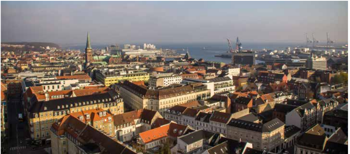
Figure 1. Aarhus, Denmark.