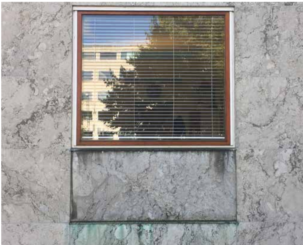
Figure 10. City Hall, detail of exterior façade.