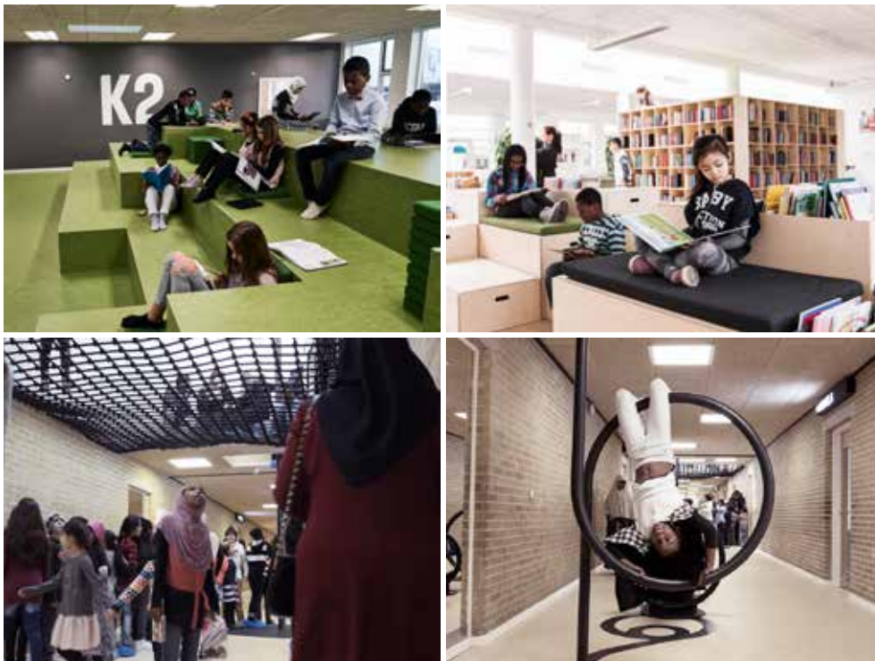
Figure 3. Søndervangskolen, Viby, Aarhus, by SMAK (compl. 2017).

Other examples of good design across Aarhus and its region include: of course, the already mentioned Dokk1 by Schmidt Hammer Lassen (SHL),