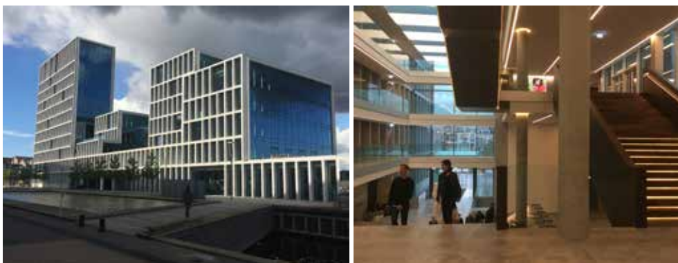
Figure 7. Bestseller Headquarters by C.F. Møller (compl. 2015).