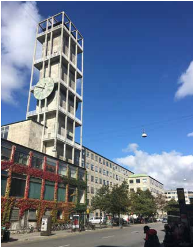
Figure 9. City Hall by Arne Jacobsen and Erik Møller (compl. 1941).