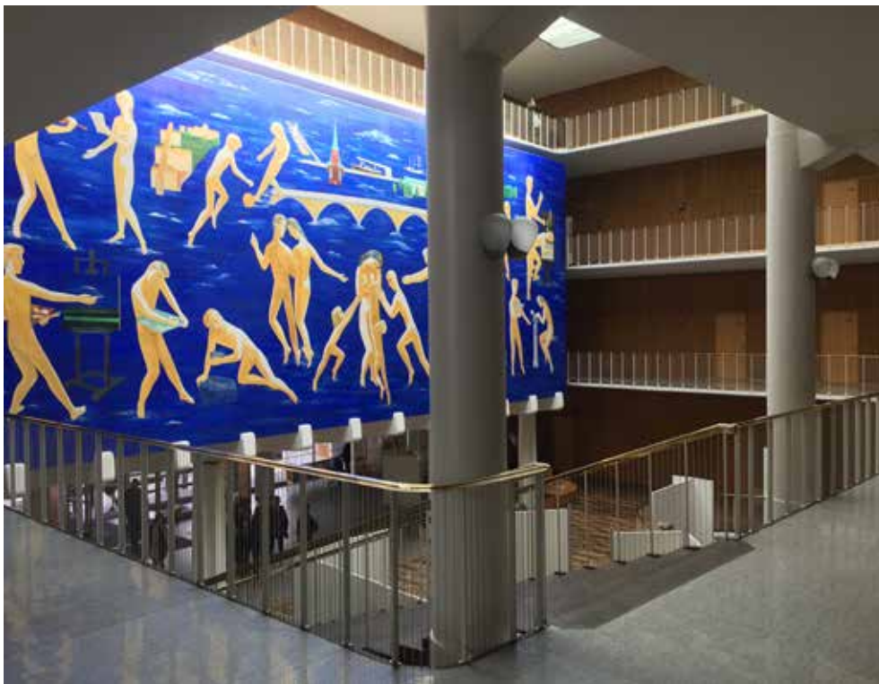
Figure 12. City Hall, the entry lobby with the mural Menneskesamfundet [The Human Society] by artist Thorvald Hagedorn-Olsen.