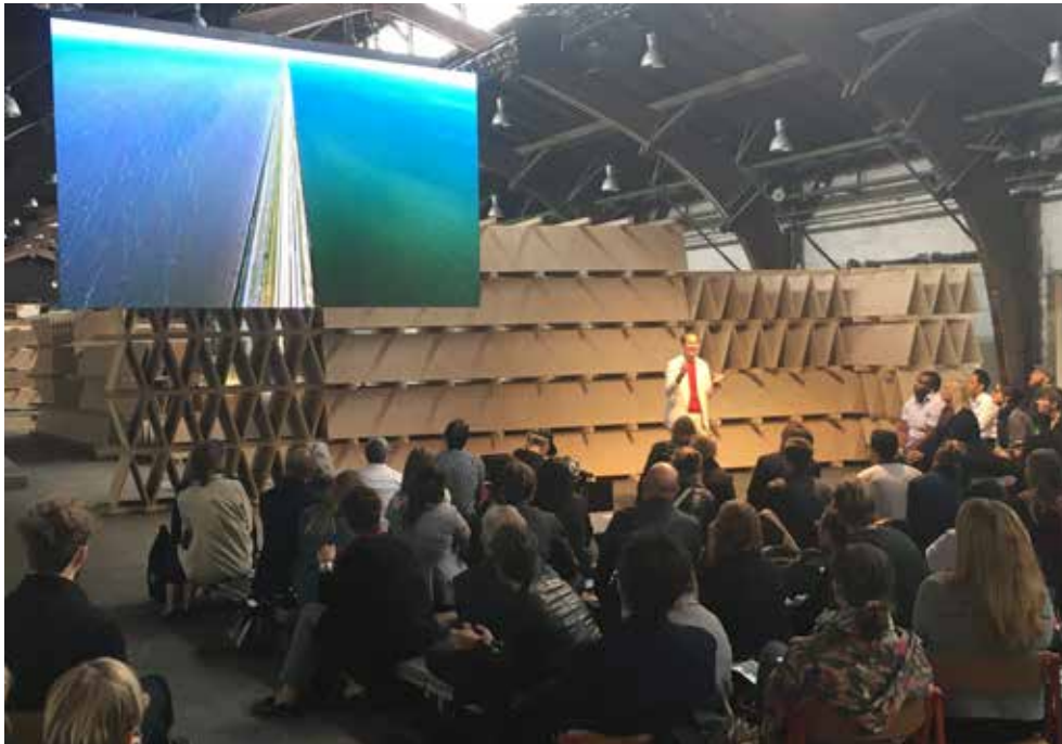
Figure 16. Daan Roosegaarde during his key-note speech, discussing his Icoon Afsluitdijk project in The Netherlands.

By tackling design problems with the ingenuity of an inventor and the unpredictability of an artist, Roosegaarde has produced very diverse and remarkable designs that also try to address some of the biggest global challenges of our time. Those include: the Smog Free Tower, an environmental device/park-pavilion that sucks up smog to produce clean air (reducing smog by 20 to 40%, and producing diamond rings from the captured CO 2 , which in turns helps crowdfund the towers themselves); Waterlicht, an award winning lighting installation for public space that is now touring the world to raise awareness about rising sea level; Icoon Afsluitdijk, a series of interventions (such as an interactive exhibition and a lighting design) at the 1930s landmark infrastructure of the Netherlands, the 32 km [2 mi.] long dike separating the North Sea from the IJsselmeer; and a forthcoming project on how to handle our massive space debris that is increasingly polluting the earth's atmosphere.