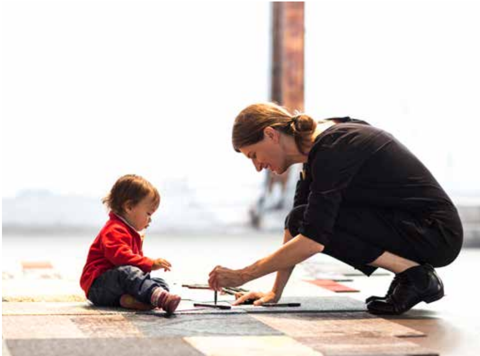
Figure 17. Break-out session on design fundamentals... the Danish Way...

will continue to grow and offer new ideas and experimentations from which to be inspired and challenged.