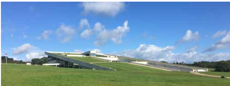
Figure 6. Moesgaard Museum by Henning Larsen (compl. 2014).