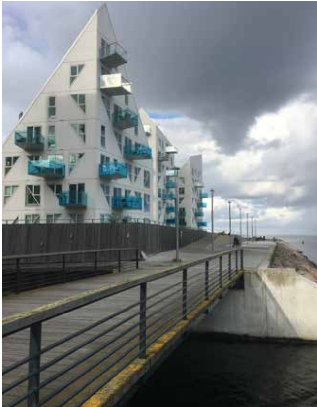
Figure 8. Residential complex "Iceberg" by CEBRA + SeARCH + JDS + Louis Paillard Architects (compl. 2013).

waterfront, in its white silhouette against the blue of the sea and the stark green backdrop of the Riis Forest, just north of downtown, as carefully planned in its residential typology and micro-urban relationships.