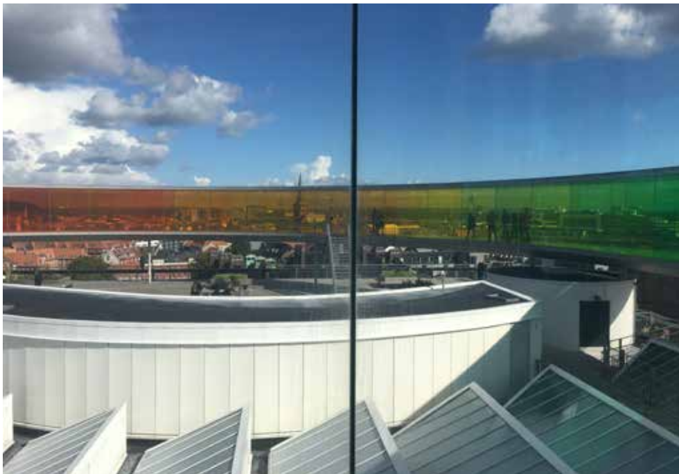
Figure 5. ARoS Kunstmuseum by Schmidt Hammer Lassen (compl. 2004; Rainbow Panorama top addition by Olafur Eliasson, compl. 2011).