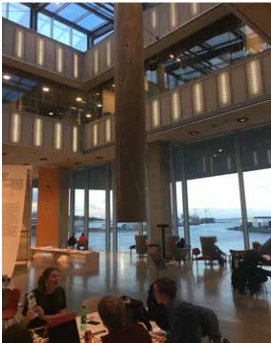
Figure 4. Dokk1, civic public library, by Schmidt Hammer Lassen (compl. 2015).