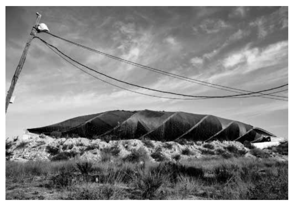
Figure 2. Unfinished Toyo Ito's pavilion at the natural park of the Salinas de la Mata, Torrevieja, Alicante, Spain (2014).

recuperation of the link between the industrial exploitation of salt and nature in the Protected Natural Area of Las Salinas and Arenales of San Pedro del Pinatar in the Region of Murcia.