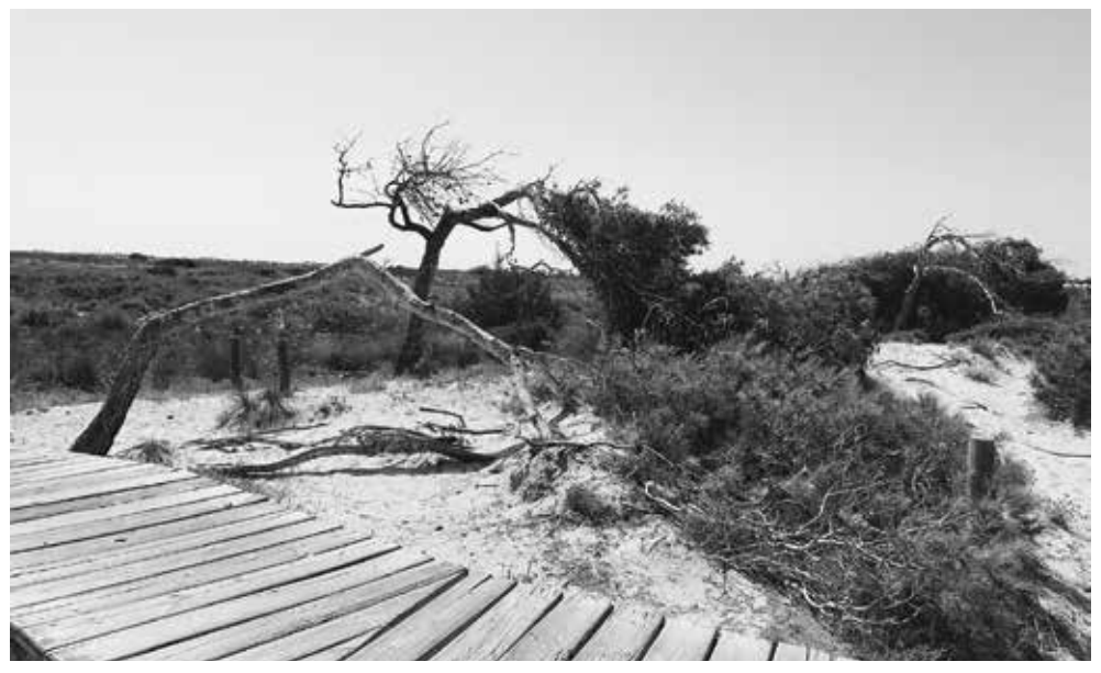
Figure 6. Three twisted individuals in the salt marsh forest, San Pedro del Pinatar, Murcia, Spain (2017).

Even though the salt pools in the Regional Park of the Salinas and Dunes are still the most characteristic part of its landscape, the proposal by Muñoz Criado highlights, together with the coastal forest, other geomorphological elements of the area such as dunes, beaches and salt works (Fig. 7). The innovation of Muñoz Criado's plan is that her proposal does not intervene directly in the salt pools, but instead accentuates the peripheral elements as the true heirs of a multifunctional territory. This resilient periphery is key in the interworking between the artificial and natural landscape of the salina by defining a robust ecological and resilient edge for future social, cultural, economic and environmental progress.