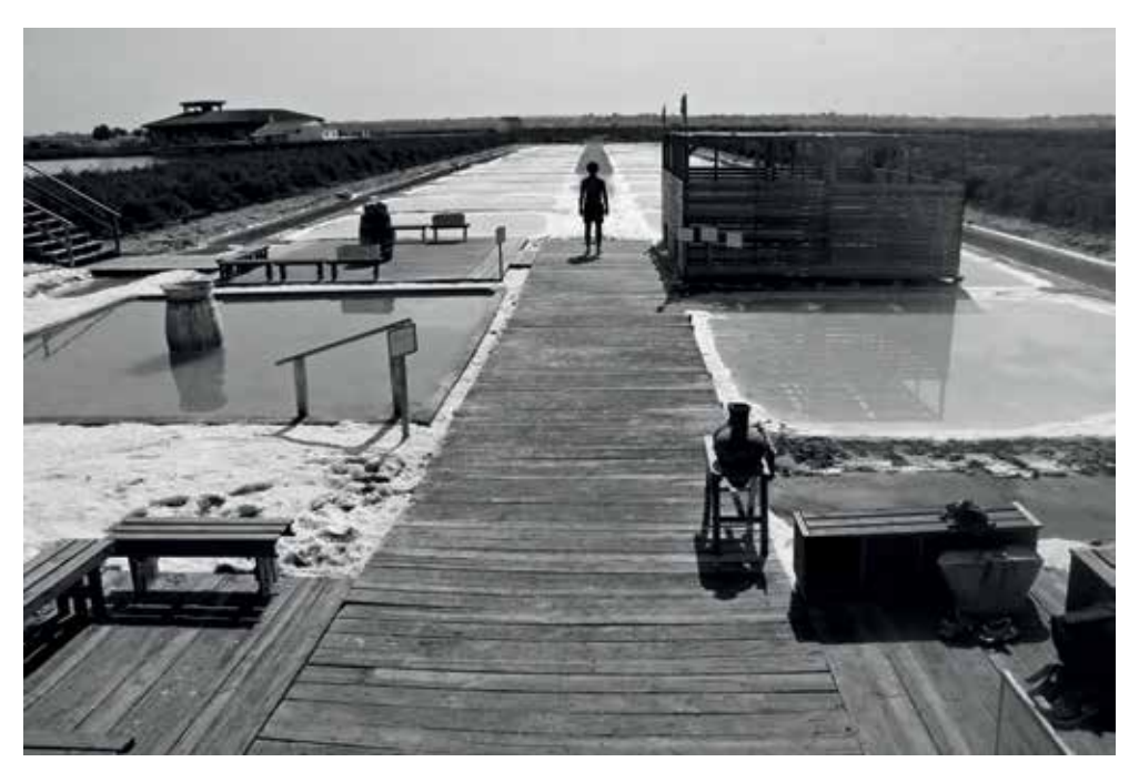
Figure 4. Outdoors salt recreation spa intervention, Chiclana de la Frontera, Cadiz, Spain (2017).

The idea to introduce a new program in an artisanal salt work can be seen in the example of the first outdoors sustainable salt recreation spa in Europe located in Chiclana de la Frontera in the southwest coast of Spain. The proposal unites tradition and new activities as part of a private initiative that offers an alternative tourism through the connection of new proposals with old industries found in the area. The project, with an extremely low environmental impact, is located in the nature preserve of the Bahia de Cadiz, in the salina known as Santa Maria de Jesus. The intervention consists of a set of small demountable wooden platforms and pavilions that sit on top of the tajos , or pools of the salina at the final stage of the evaporation process. This is the moment when the water reaches its maximum level of salinity during the summer (Fig. 4).