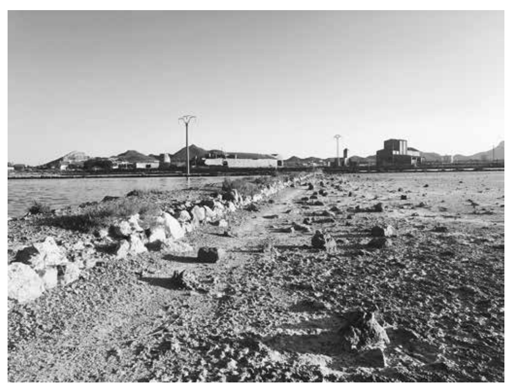
Figure 1. State of abandonment of the Marchamalo salina, Mar Menor, Murcia, Spain (2017).

Southeastern Spain (Fig. 1). Marchamalo represents a clear case of abandonment due to the lack of funding and political coordination, and the absence of new ideas. Local agents have not been able to find a solution to this resilient and centenary edge, despite its privileged location next to the Mar Menor salt lagoon. This unique area hosts an extremely important ecosystem for bird migration and part of the special protection plan as a Lugar de Importancia Comunitaria (LIC),<sup>2</sup> as defined by the policies of the European Union. In other examples, where funding was not a problem and the embracing of new programs beyond salt production were introduced, the value of this resilient edge has been put under pressure.