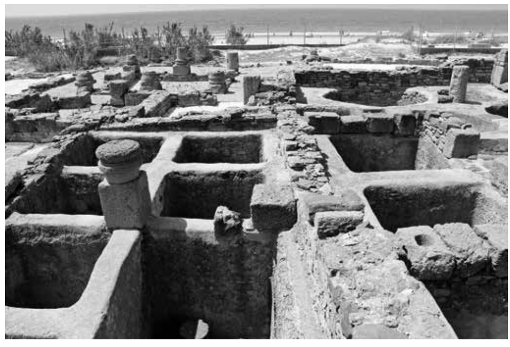
Figure 3. Salt wells at Baelo Claudia's archeological site, Tarifa, Cadiz, Spain (2017).

The almost two thousand years of resilience of this historical-cultural boundary was made possible by its geographic isolation and the protection of the remains by wind swept sand dunes. Considered as the best preserved archeological site in Spain, its excavations began at the beginning of the twentieth century, but the Research Project for the Study of the Southern Regions Archeological Complexes was initiated only in 1999, and financed by the regional administration. In 2007, the internationally recognized architect Guillermo Vázquez Consuegra was charged with the task of developing a master plan for the archeological site as well as for the design of a visitor's center and entrance for the conserved remains.