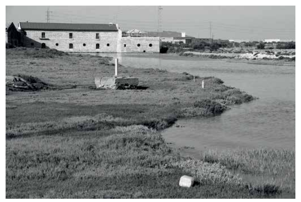
Figure 5. Tidal Mill's restoration Puerto de Santa Maria, Cadiz, Spain (2017).

years of the tidal mill into the hands of a private entity granted by the administration was received with criticism from local ecological nonprofit organizations. Ecologistas en Accion heavily opposed the privatization of the mill and reported that the historical and cultural landmark of the mill within its natural landscape should have not been transferred to a private entity but kept as a public one. <sup>12</sup> In response to these concerns, one can also argue that the research carried out by the restaurant and its respectful relationship within its context allows for the initiation of new local approaches of economic revitalization at the edge of the salina . An initiative that reduces the possibility of neglect and guarantees an activity within the walls of an almost forgotten structure of the hydraulic and historic heritage.